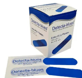
PLASTERS BLUE (100) SKU: 748 Price: $9.26 + GST