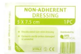
NON ADHERENT PAD 7.5CM - 5CM SKU: 578 Price: $0.40 + GST