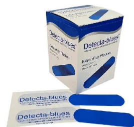
PLASTERS BLUE (100) SKU: 748 Price: $9.26 + GST