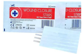
WOUND CLOSURE STRIPS (5) SKU: 1063 Price: $1.91 + GST