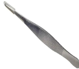
TWEEZERS - SHARP POINT SKU: 1012 Price: $3.16 + GST