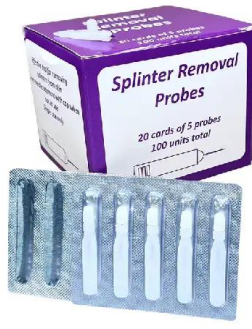
SPLINTER REMOVAL - SINGLE PROBE SKU: 894 Price: $0.60 + GST