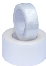
MEDICAL TAPE PERFORATED 25MM X 9M SKU: 732 Price: $2.48 + GST