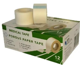
MEDICAL PAPER TAPE - 25MM X 9M SKU: 705 Price: $2.02 + GST