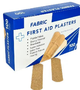
PLASTERS - FABRIC (100) SKU: 756 Price: $6.79 + GST