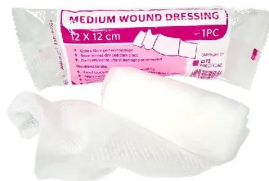
WOUND DRESSINGS MEDIUM SKU: 1065 Price: $1.39 + GST