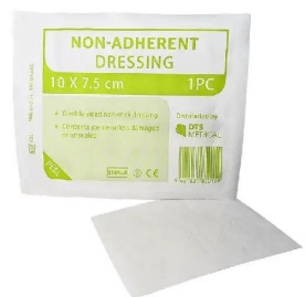
NON ADHERENT PAD 7.5CM X 10CM SKU: 579 Price: $0.50 + GST