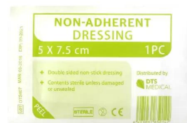
NON ADHERENT PAD 7.5CM - 5CM SKU: 578 Price: $0.40 + GST