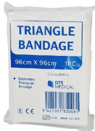
TRIANGLE BANDAGES SKU: 1007 Price: $0.94 + GST