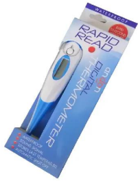
THERMOMETERS - DIGITAL SKU: 211 Price: $7.88 + GST