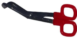
SCISSORS - FIRST AID SKU: 858 Price: $2.77 + GST