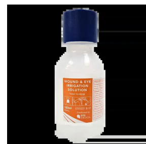
SALINE EYE WASH & WOUND BOTTLE 100ML SKU: 2506 Price: $6.99 + GST