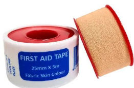
MEDICAL TAPE FABRIC 25MM X 5M SKU: 002 Price: $2.34 + GST