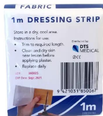
PLASTERS FABRIC DRESSING 1 METER SKU: 749 Price: $2.87 + GST