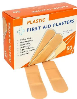
PLASTERS PLASTIC (50) SKU: 2619 Price: $2.93 + GST