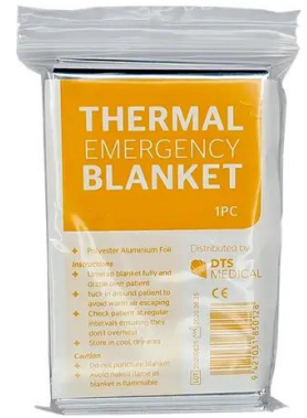
THERMAL EMERGENCY BLANKET SKU: 983 Price: $2.56 + GST