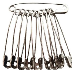
SAFETY PINS (10) SKU: 845 Price: $1.83 + GST