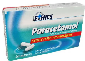
PARACETAMOL SKU: 706 Price: $3.50 + GST