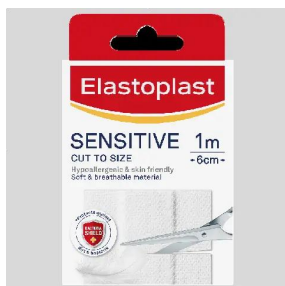
PLASTER SENSITIVE DRESSING STRIP 6CM X 1M SKU: 1473 Price: $8.67 + GST