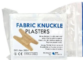
PLASTERS FOR KNUCKLES SKU: 753 Price: $0.29 + GST