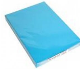
COLOUR PAPER A4 - BLUE (500)