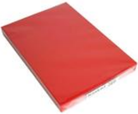
COLOUR CARD 210GSM A4 - RED (100)