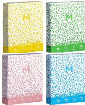
COLOUR COPY PAPER A4 - BULK DISCOUNT @ $14.79 PER REAM