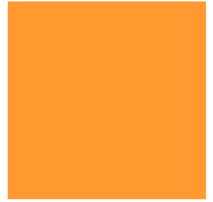
COLOUR CARD 210GSM A4 - ORANGE (100)