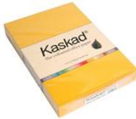
COLOUR CARD 210GSM A4 - YELLOW (100)