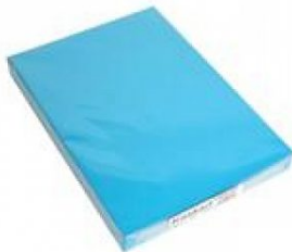
COLOUR CARD 150GSM A4 - BLUE (100) SKU: 1365 Price: $14.85 + GST