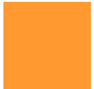
COLOUR CARD 150GSM A4 - ORANGE (100) SKU: 1367 Price: $14.85 + GST