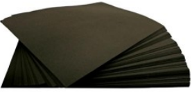
BLACK PAPER 112GSM (250 SHEETS) A3 SKU: 677 Price: $25.68 + GST