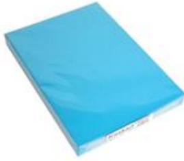
COLOUR CARD 210GSM A4 - BLUE (100)