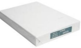
PHOTOCOPY PAPER PER REAM A3 SKU: 736 Price: $25.39 + GST