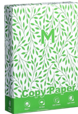
COPY PAPER (500) A4- GREEN