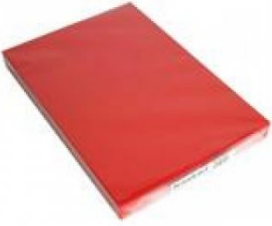
COLOUR CARD 150GSM A4 - RED (100)