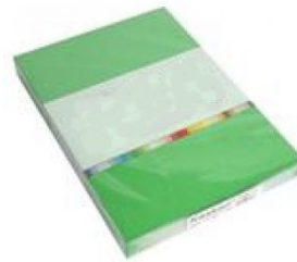
COLOUR CARD 150GSM A4 - GREEN(100) SKU: 1364 Price: $14.85 + GST