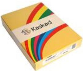
COLOUR PAPER A4 - YELLOW (500)