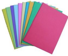
COLOUR CARD 150GSM (100 SHEETS - 10 MIXED COLOURS) A3 SKU: 650 Price: $25.17 + GST