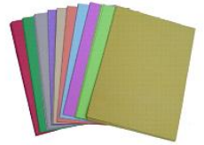
PAPER COLOUR 80GSM (100 SHEETS - 10 MIXED COLOURS BRIGHTS AND PASTELS) A3 SKU: 700 Price: $11.02 + GST