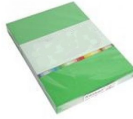
COLOUR CARD 210GSM A4 - GREEN (100)