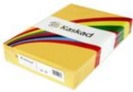
COLOUR CARD 150GSM A4 - YELLOW (100)