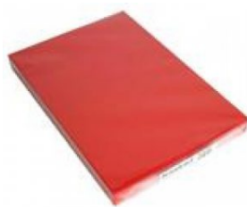
COLOUR PAPER A4 (500) - RED