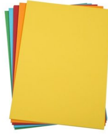
PAPER - 5 COLOURS A3 75GSM (100 SHEETS) SKU: 2748 Price: $6.10 + GST